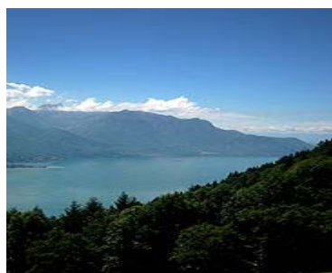
"Lake Geneva from Caux",

Lake Geneva: This crescent-shaped lake, formed by a withdrawing glacier, narrows around Yvoire on the southern shore, the lake can thus be divided into the "Grand Lac" to the east and the "Petit Lac" to the west. Lake Geneva is really just a part of the River Rhône, which rises at the Furkapass and flows westwards between the mountains of Canton Valais to enter the lake near Villeneuve. Its water takes an estimated seventeen years to cover the 73km to Geneva before flowing on through France into the Mediterranean near Marseille.