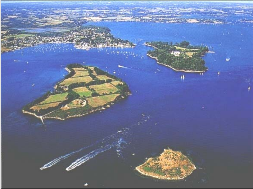
Golfe du Morbihan