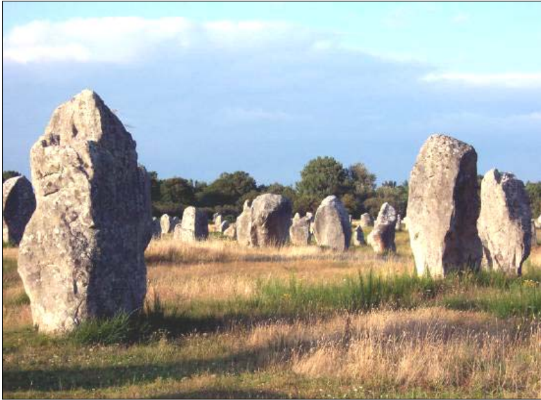
Megalithic monuments at Carnac