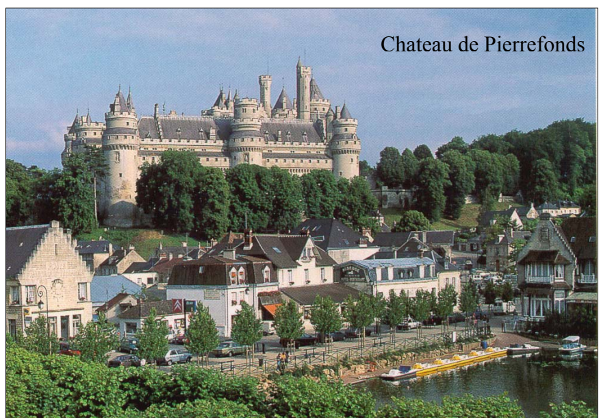
Chateau de Pierrefonds