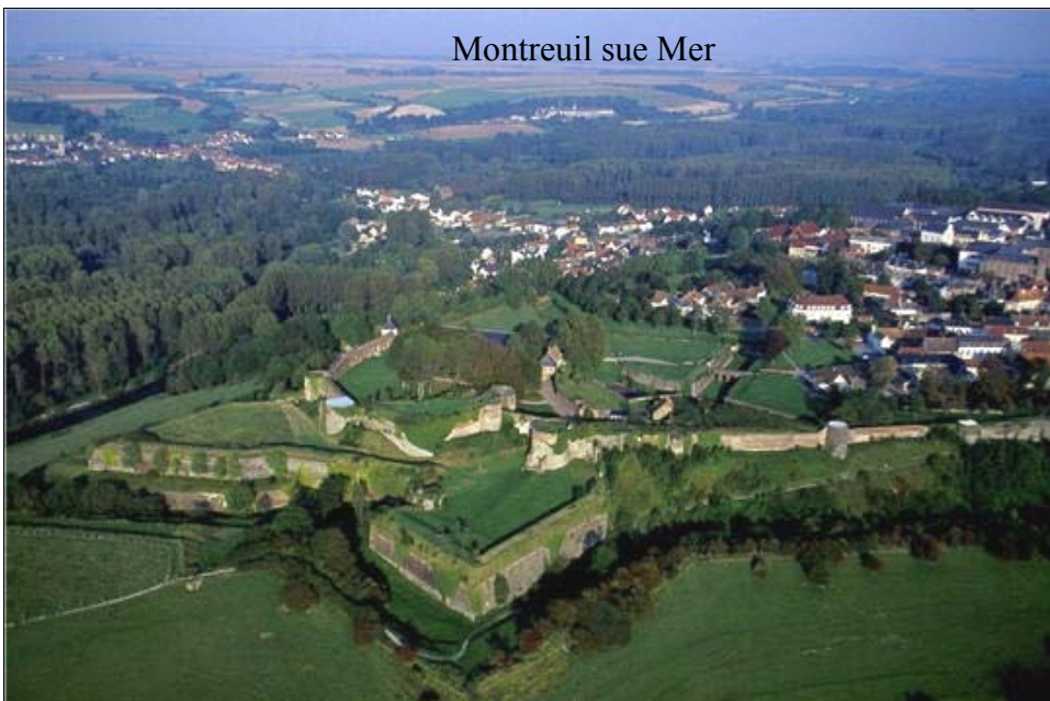
Montreuil sue Mer